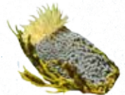
Wandering anemone (Kotōre moana)