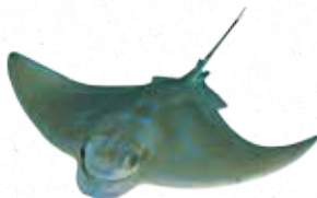
Eagleray (Whai keo)