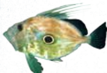
John dory (Kuparu)